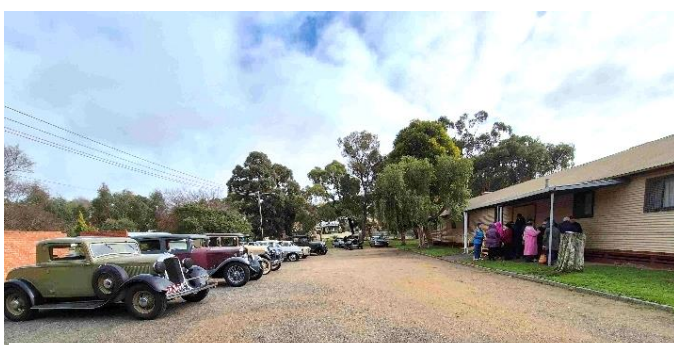
The line up of vintage cars at the clubrooms

Car enthusiasts can be found anywhere with a farmer in his driveway turning off his tractor and watching us all pass. A highlight of this stretch was a tinsel