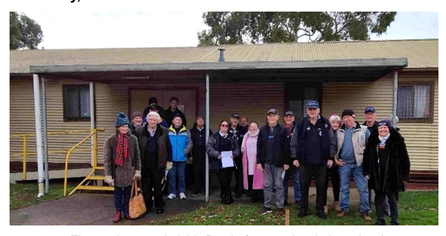
Those who attended this Run before starting their engines!

Meeting at the soon to go club rooms for the very last time (or what we thought, anyway), 21 cars and 37 people left almost on time. Considering the cold and drizzle earlier in the morning, there were a good number of nakeds, mixed with vintages and classics and a couple of moderns.