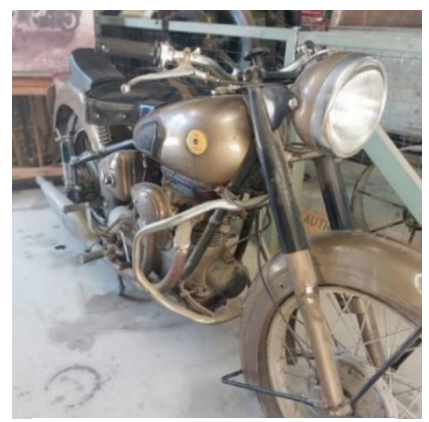
This is a Sunbeam motorbike