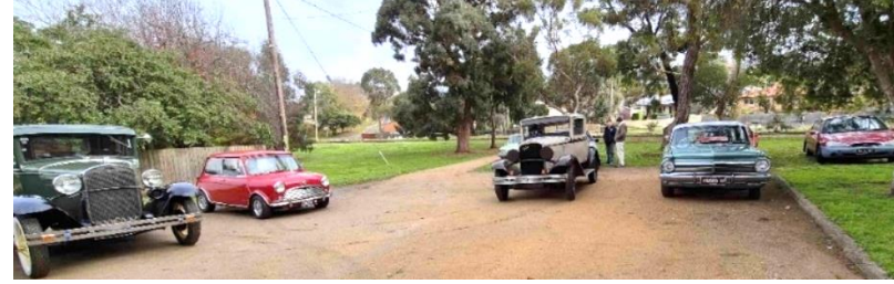
A mixture of classics with the nakeds

With the outskirts of Geelong coming into the further view, we turned left into Friend In Hand Road (ummmm - that had to be named after an old pub run by a Britisher!) back towards