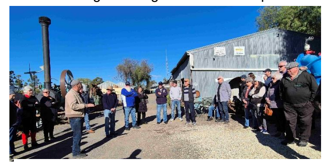
Everyone gathered around to hear the story of the Museum

A new section of the museum is dedicated to the old timber industry of the town. It includes a huge display of old saws. axes and other equipment from the timber industry. A large collection of equipment from the Thompsons factory in Castlemaine is a highlight of the display. There is also a small open goldmine that you can enter.